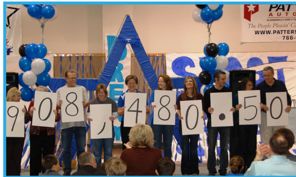
“Shoot for the Stars” Campaign Leadership Team members reveal total funds given so far at the Kick-Off Pep Rally in March.

But you, our constituents, are key to the success of this campaign. The campaign spans three years, and we solicit your prayers and your gifts as we continue to raise funds. Won’t you make a commitment to assist us with this project as we strive to educate the whole child academically, athletically and spiritually? It is our mission to provide a quality education in a Christian environment that inspires hearts, minds and souls for successful living. With partners like you, this mission, as well as growth and change, will continue at WCS.